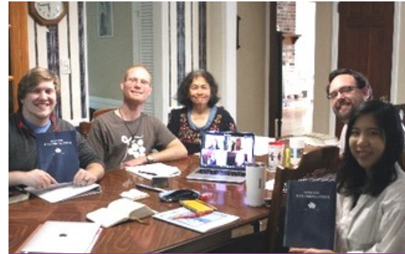
JCCT - In-Person and Online

JCCT (Japanese Christian Community in Tucker) got started in April this year. We went through a great study on Spiritual Discipleship (Kirisuto no Deshi toshite Ikiru) addressing topics such as Truth, Faith, Hope, the Glory of God and more. We recently started a new book called Becoming a True Worshiper. This is to help new Japanese believers grow in their relationship with Jesus and learn what it means to follow Christ. Utilizing the zoom, the group even reaches those who are not able to meet in person. These discipleship resources by Second Level Publication have been very helpful and effective for both new and long-time Christians.