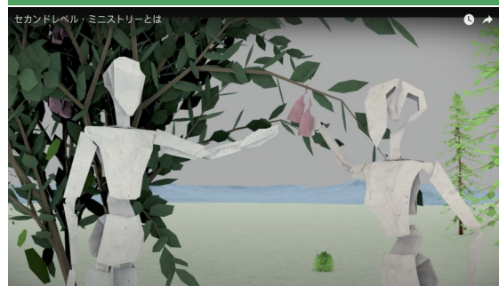
What is Second Level? Share about our resources and opportunities! Go to https://secondlevel.org/yokoso/

Check out our social media page! Search by "Secondlevelministry"